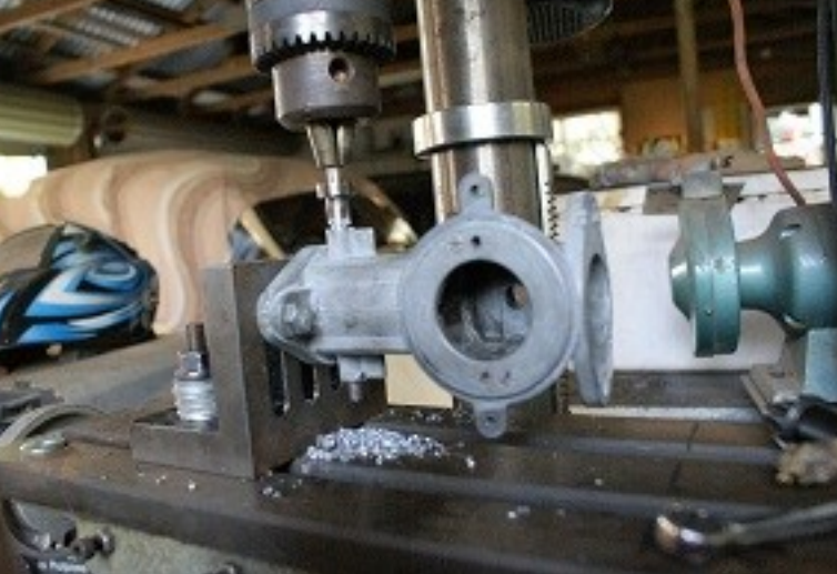
Above: The butterfly shaft being reamed

My first inclination was to set the carburettor