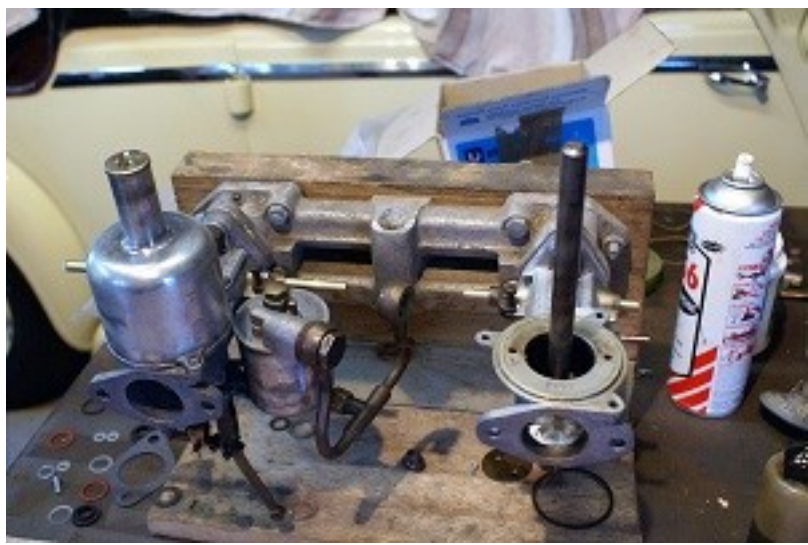
Above: The carburettors being assembled

binding is using a dummy shaft. This was explained and an example provided to me by Jack Warr about 20 years ago and I have still got it and use it when required to this day. It's overall length is 8 1/4 inches, the bottom section is 2 inches long and 1/4 inch in diameter and the remainder is a 1/2 diameter.