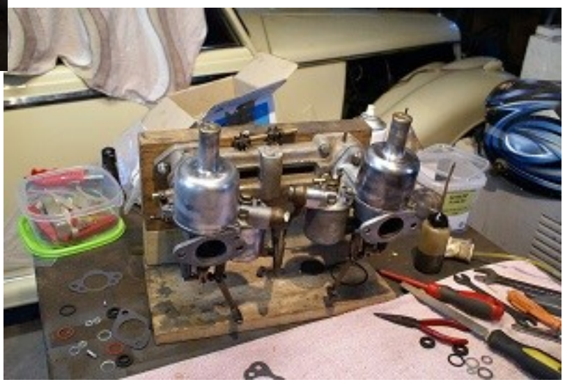
Above: Carburettors assembled

Readers can see that the shaft fits through the carburettor body into the opposite bush to create an accurate cut. The reamed side is then fitted with a bronze bush and the Carburettor body is turned over and using the new bush to centre the ream for the opposite side the procedure is repeated and the second bush is fitted.