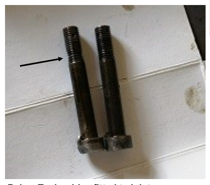
Below Tacho drive fitted to inlet cam

After a few days break from Riley restoring, the engine and gearbox was removed from Albert, the engine separated from the gearbox, fitted onto the engine stand and turned upside down. The sump was then taken off and the big end bolts removed one at a time and the ARP bolts fitted in their place. The ARP bolts were each greased with the substance supplied by the manufacturer and torqued to 45 foot pounds. The second last bolt is pictured below. Can you see the difference with the bolt next to it and can you imagine the relief of the restorer when the defective bolt was removed and discarded? It was significant. Some readers will recall a story about the catastrophic failure of an engine in a remote part of Victoria after the Merimbula National Rally. It was likely caused by a big end bolt failure.