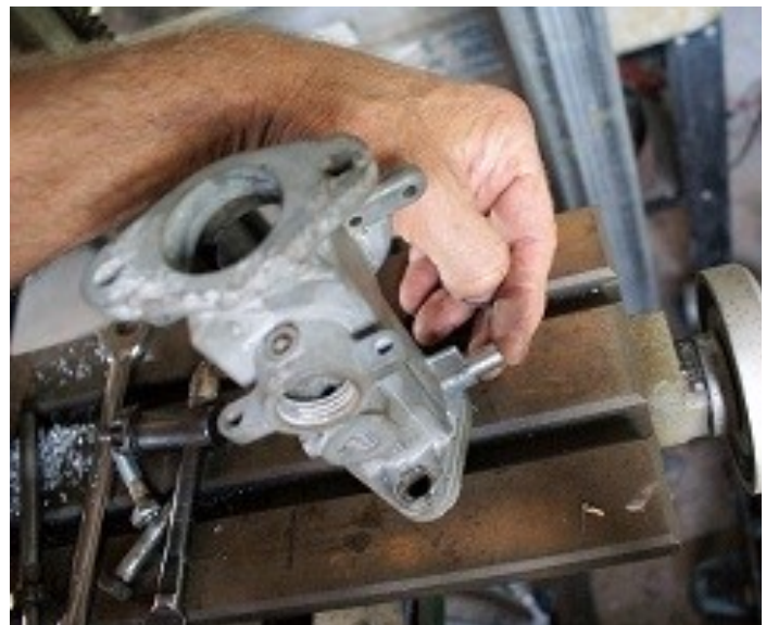
Above: Butterfly shaft bushes being pressed into position

flies were fitted into the shafts. The stops were then fitted over the shafts and careful attention was paid to holding the butterflies closed with the stop screws set at two turns out of the stop bodies and a 3MM drill bit was passed through the stops and butterfly shafts. In this particular case, a dremmel was used in a dremmel pedestal press and this produced an accurate hole that could accommodate the steel peg to hold the stop in place. The peg is conical in shape and after fitting it into place it was punched so that a firm fitting was achieved.