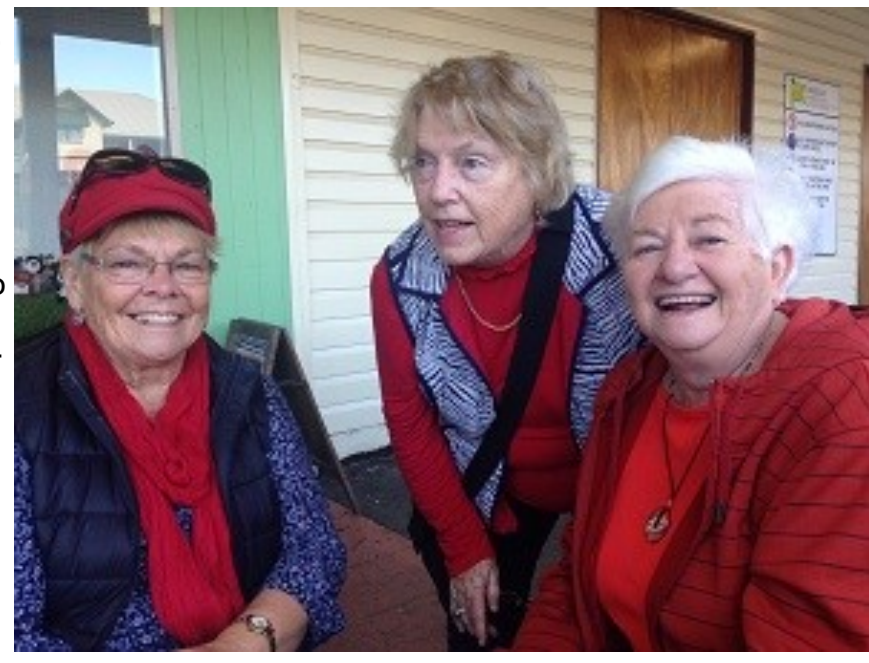
Above: some of the ladies who attended the rally

Through a set of amazing coincidences, we met a family who had just acquired 3 Rileys (2 from Victoria and 1 from NSW), who live in Rockhampton. The