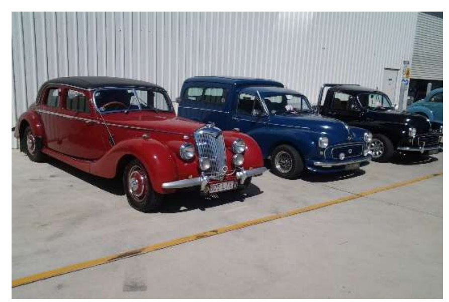
Mark Baldock's 21/2 at the Tour

1. Most of the early engines stipulated a 40 or 50 grade engine oil or equivalent. In many cases oil travelling down vertical shafts usually ended up lubricating bevel gears and cross shafts etc. Thin oil being used in the same application would result in the oil being thrown from the bevel gears leaving the cross shaft gears dry.