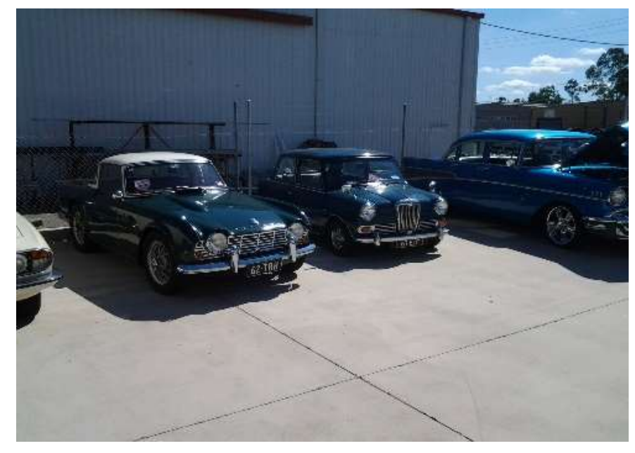
Simon Schooneveldt's Elf at the tour

Detergents are incorporated into all modern motor oil formulations and have been since the 1940s. Their function, as the name suggests, is to maintain internal engine cleanliness particularly in areas of high temperatures such as piston skirts, ring lands (the slots in which the rings sit) and other components. They are also useful in combating the effect of acid contamination in the crankcase oil caused by the by-products of combustion.