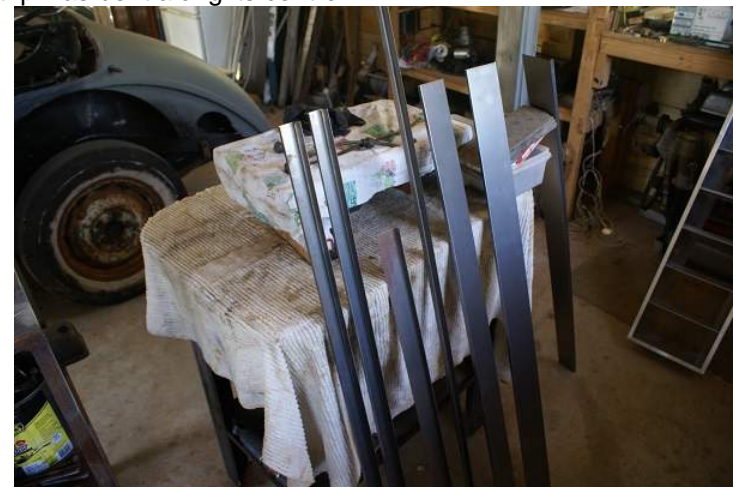
Steel strips cut and bent

strips; two at 2 ¼ inches, two at 3 ¼ inch and two at 3 ¾ inch. All of these had a right angle bend put into them a ¼ inch from the edge to provide overlap or back edge to go around the door posts. A single strip was cut 1 ¾ inch wide and this had a right angle bend on either side. Another strip was cut one inch wide with a ¼ inch right angle bend on either side and last a half inch strip was bent along its centre.