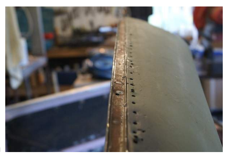
Water exclusion channel in situ

A lot of thought went into the sequence of making the steel skins for the door posts and outer sills as this was the first attempt at making them. After the head ache subsided the project was begun by cutting a panel beaters steel sheet into