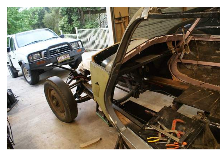
Steel skin for the door post and the square shape to sit against the quarter window

Two pieces of the 1 ¾ inch steel that in 'plan view' resembled the shape of three sides of a square was cut to length and with a wooden template the steel was gently stretched around the curve to match the shape of the quarter window. When they matched the curve of the timber that formed the quarter window stop a small piece of steel was welded on the top end to marry up with the header stick steel skin. Prior to pressing it into its place several small holes were drilled into the front and back of the steel shape so that later it could be nailed into place onto the door post.