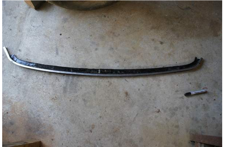
Water exclusion channel welded to header stick steel skin

The final activity was to see if it fitted to the head of the windscreen surround. It fitted beautifully and I felt rather satisfied with the effort until the hood was pulled down. Months ago the areas where rust had eaten away the window surround had been replaced and the top driver's side corner was a quarter of an inch too wide. Making it had been a difficult operation at it had compound curves. Now it was found that it needed to be reshaped. So the window surround was taken off, modified to the correct shape and refitted. This time when the hood was pulled down it met the header stick in just the right location (give or take a 1/16<sup>th</sup> of an inch). That seemed to be a pretty good outcome so it was left at that.