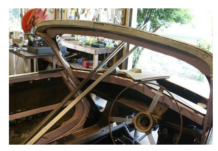
Header stick and steel skin fitted

The final activity was to see if it fitted to the head of the windscreen surround. It fitted beautifully and I felt rather satisfied with the effort until the hood was pulled down. Months ago the areas where rust had eaten away the window surround had been replaced and the top driver's side corner was a quarter of an inch too wide. Making it had been a difficult operation at it had compound curves. Now it was found that it needed to be reshaped. So the window surround was taken off, modified to the correct shape and refitted. This time when the hood was pulled down it met the header stick in just the right location (give or take a 1/16<sup>th</sup> of an inch). That seemed to be a pretty good outcome so it was left at that.