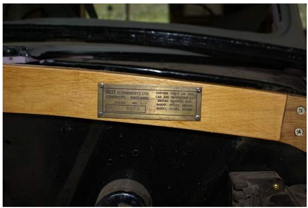
Chassis number plate

The last picture shows the chassis number plate. It was a particularly special moment to screw it onto the timber. Thank you Ross, for passing it on to me.