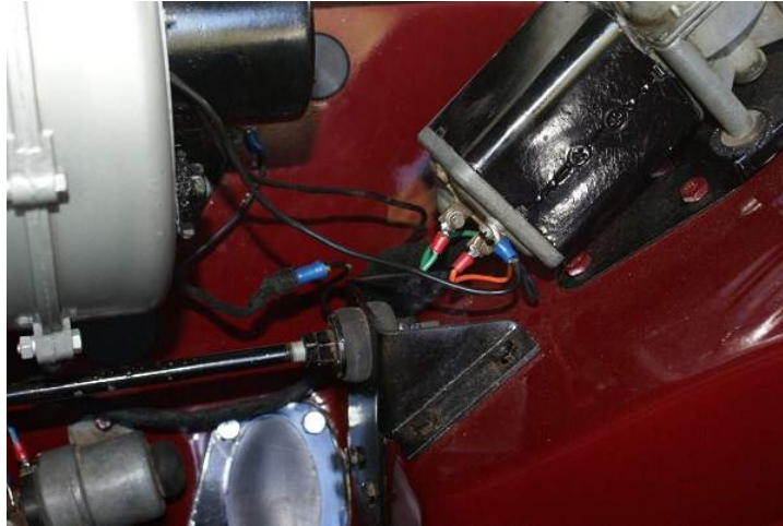
A one speed wiper motor.

Apart from that connecting the wires to the reverse switch and threading the steering column wires, fitting the rest of the wiring harness to their correct contacts was the easy part of the project as all that was required was following the dummies guide in conjunction with the wiring diagram. The reverse switch is on the side of the gear box and inside the drive shaft tunnel. It was impossible to get a screw driver onto the top terminal so after some thought the switch was unscrewed, the harness connections modified to fit up to the electrical connector block. They were then bound together with automotive wiring tape and the reverse switch was screwed back into its housing. The wires were then threaded under the floor to the drivers' side door channel and threaded through the floor and connected to the wiring connector block terminals on the drivers' side quarter panel. The steering column wires only just fitted into the tube but the friction between the wires and tube prevented them from passing through so after four attempts they were oiled up and on the fifth attempt with oil they passed through. Connecting the wires to their terminals took about eight days spread over fourteen days as the RMH project was interspersed with gardening, replacing the steering column wires in George and playing with oil pressure release valves. The story of the valves might be included in this month's club magazine.