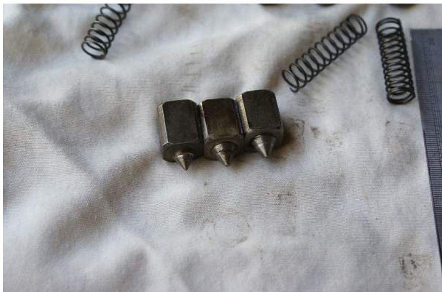
The three oil release valves compared.

The next thing noticed was the wear on the valves themselves. If you look closely at them you will notice differences in the wear on each of them. The valve that was in George is significantly indented on one side so it might be conjectured that with repeated sudden changes in oil pressure the valve could have been opening and closing pounding the valve so that it was indented on one side? Maybe my imagination is a bit wild, do you think? Well, it could have only been achieved with repeated reasonably hard closures of the valve to indent it to the extent that it has. Now that could explain the variation in oil pressures when the engine is at the same temperature. The wear on the valve could shift about in its position on the release aperture.