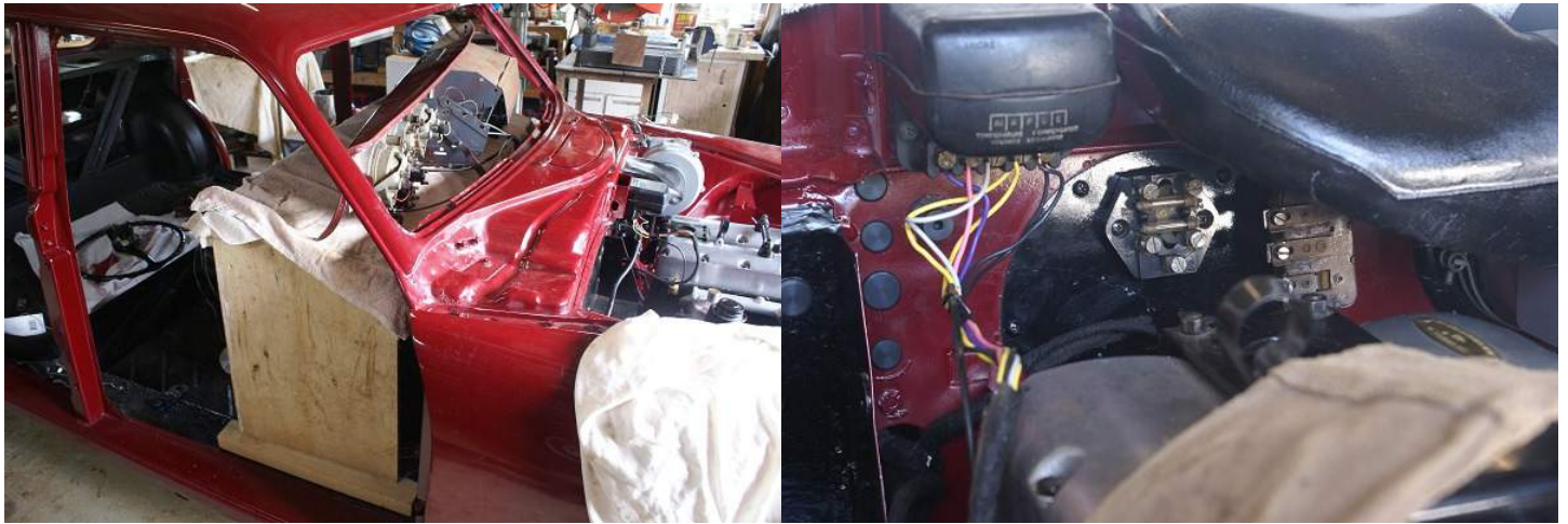
Dashboard table in situ and dash table seen with control box and fuse box.

The easy bit was connecting the under bonnet parts including regulator, alternator, coil, temperature sender, solenoid, starter, horns and running the lighting wires through to their designated locations. The difficult bit included arranging the wiring to connect up to the instruments, altering the wiring to suit Greg's specific requirements and working out why the diagram showed 5 wires to the windscreen wiper motor when there were only 3 terminals. To connect the wiring to the instruments a table was constructed from ply, covered with three (clean) garage towels and placed in the car in front of the dash. The dash was then laid on the table and the harness connected to its appropriate instruments. The second issue was not really that hard to accomplish as Greg wanted to use an alternator which meant negative to earth. He also wanted indicators to run off the trafficator circuit and a third stop light in the rear window. A significant difference between the pre-war cars and earlier RM's is that most of the instrument wires are connected with electrical connectors instead of screws.