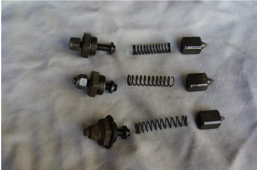
Oil release valve assemblies.

Well, that experience started a wondering about oil pressure from pump through the mains and big ends, cam shaft bushes, rockers and to the oil pressure release valve to the sump. Why was there inconsistent variation from cold to hot and particularly variation when the engine was hot from 40 down to 20 psi at 35 MPH on the oil pressure gauge? During that period of wondering a chance conversation occurred with Ian Henderson who had been assisting Brian Jackson on a RMF oil pump rebuild. Apparently the RMF and the Pathfinder have larger oil pumps to overcome the low oil pressure at idle in the earlier RMs. Well, that sparked another conversation with Ken who talked about the various qualities of oil that are on the market. 'Good quality oil maintains a more even viscosity over the heat range', he said, 'and poorer quality oil gets a lot thinner at higher temperatures so at idle the oil pressure can register between 0 and 20 psi'. That described the first issue. During the first 500 miles George has been provided with a cheaper grade oil without additives so there was a high range of oil psi from a cold to a hot engine. But it didn't explain the second issue. Why was there so much variation in oil pressure when the engine was hot and the car was travelling at the same speed? Well today the oil pressure release valve was taken out of George and compared with two other release valve assemblies.