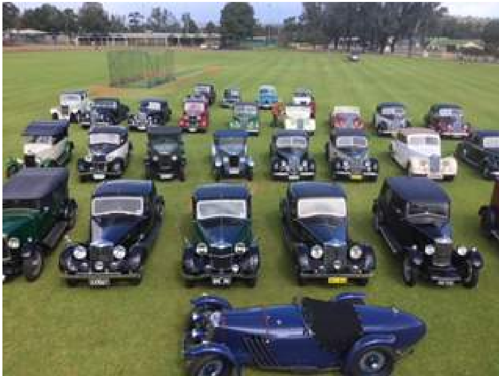
Panorama of Rileys