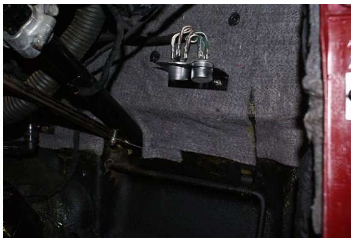
Flasher units under the driver's side dash.

Greg wanted the trafficators to work with the indicators so flasher units were fitted to the trafficator circuit and located inside of the fire wall on the driver's side. A bracket was made from steel with holes cut through so the two flasher units could sit in the bracket. And alongside the trafficator circuit there were wires that fed into the flasher units and then on to the indicator locations. Another bracket was made for the dash indicator warning lights and the whole system was connected so that the trafficator switch powered indicators and trafficators together.