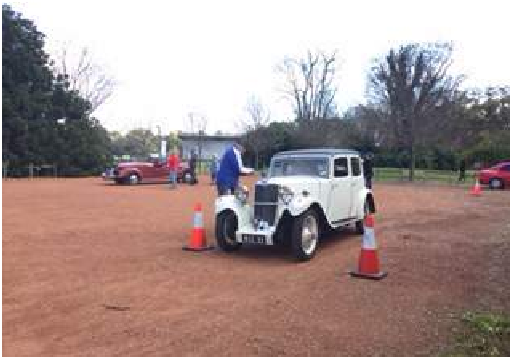
Monaco competing in the Conrod Trophy