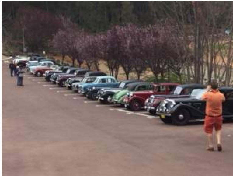
A bevy of Rileys