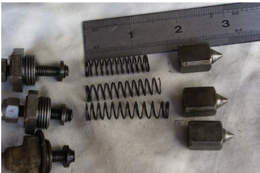
The three oil release valve springs compared.

Did you notice anything about the spring lengths or the valve tips? The first thing noticed was the difference in lengths of the oil release valve springs. The top assembly is what came out of George. The spring is more compressed than the other two. This should not make a difference to the oil pressure as all that is required is for the set screw to be wound in further for a correct pressure to be achieved and maintained. But it didn't. So have a look at the next picture and notice the uniqueness about each spring. The top spring is shorter and it was softer, but if you look at the second spring you will notice that it has not compressed but the top quarter of an inch has been worn away so that the spring ends with a sharp edge. The last spring may have been in an engine that had done fewer miles. It could be of original length and strength.