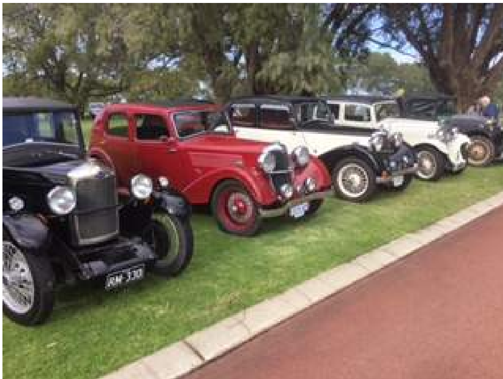
A wonderful collection of Rileys