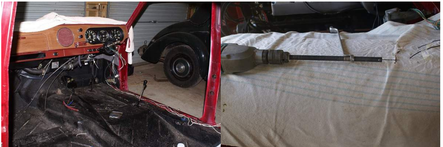
Floor mounted dip switch bracket and drill fitted to the rod on the electric drill.

The floor didn't have the right angles for a floor mounted dip switch so a steel frame was made to fit against the side of the gearbox tunnel. Happily the wires for the dip switch were made for the dash so they were more than long enough for a floor mounted version. The challenge however was that the heater components and engine had been fitted but headlight relay and fuse box had been taken out with the old wiring harness and a circular blank cover had been placed and screwed to the fire wall where these components used to live. In short there was no room to drill holes to fit the relay and fuse box. After a little thinking a rod was placed in the lathe and the end drilled with a 2 MM drill 15 MM deep. The rod was then drilled 5 MM from the end and tapped to accept a 3 MM set screw. The 2 MM drill was then fixed into the rod, a ring spanner was then threaded over the rod and held firmly against the rocker cover to steady the rod and with an electric drill the holes were bored into the fire wall to accept the relay and fuse box.