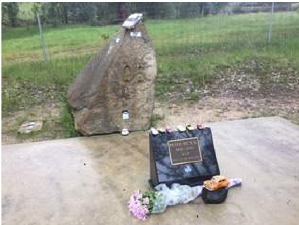
Peter Brock Memorial