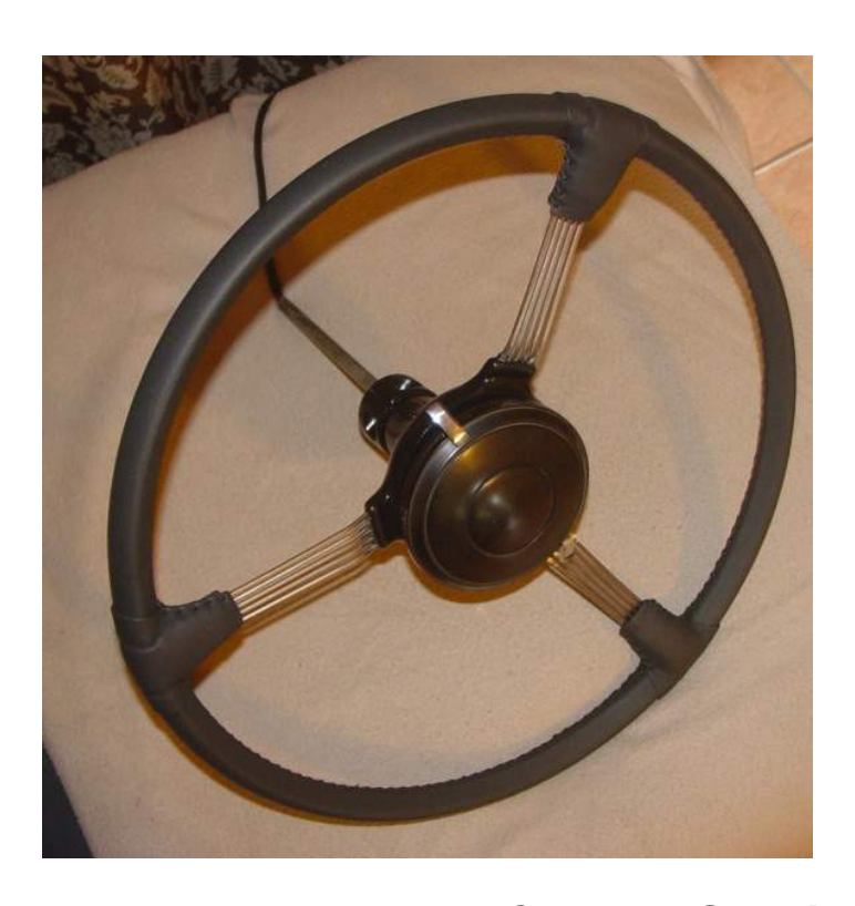
A Wet Weekend And A Leather Covered Steering Wheel