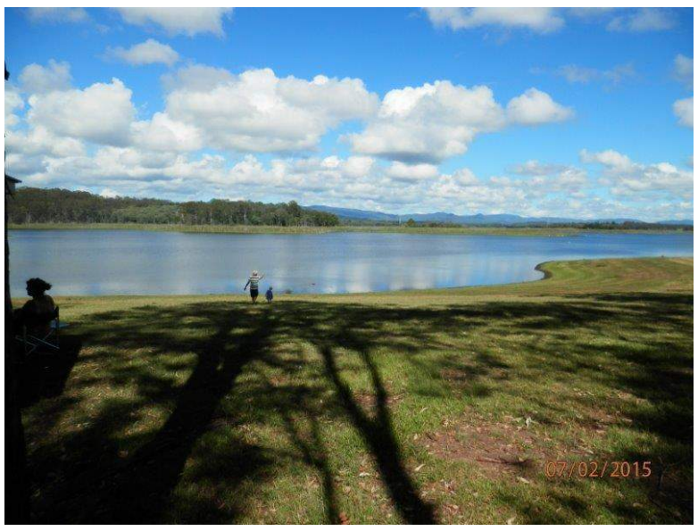
Pine Rivers Dam.

Breakfast at Bullockys Rest on Pine Rivers Dam, shared with the MG Club.